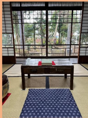
Soseki was here! ② Uchitsuboi House

a father, seeing the view of his garden from his office. The final stop is his workplace, the fifth high school. The building of the school is used as a museum in Kumamoto university now. It takes more than 30 mins walk from the house, but you go through retro Kokai shopping district and see how local people