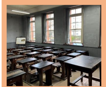
Soseki was here! ③ The Fifth High School

Let's start the Soseki tour at Kamikumamoto! He came to Kumamoto in 1896 as a teacher for the fifth high school, which is Kumamoto university now. At that time, the train he took arrived at Ikeda station, and the station built in Taisho era is now used for Kamikumamoto tram stop. Soseki must have been excited to start a new life here, seeing this scenery. Next stop is Uchitsuboi House, his fifth house in Kumamoto. When you take a bus from Kamikumamoto, you get off the bus at Tsuboi-bashi and walk for about four mins. His first child was born when he lived there. He might have written about how it felt to be