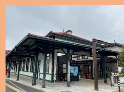
Soseki was here! ① Kamikumamoto tram stop

Soseki Natsume (1867-1916) is one of the greatest historical novelists in Japan. It's not too much to say every Japanese knows him, and even his portrait used to be printed on 1000 yen. This article will share a plan to visit three places related to him in less than 2 and a half hours.